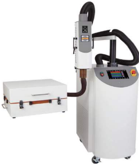
TA-5000A with Clamshell Compact Chamber