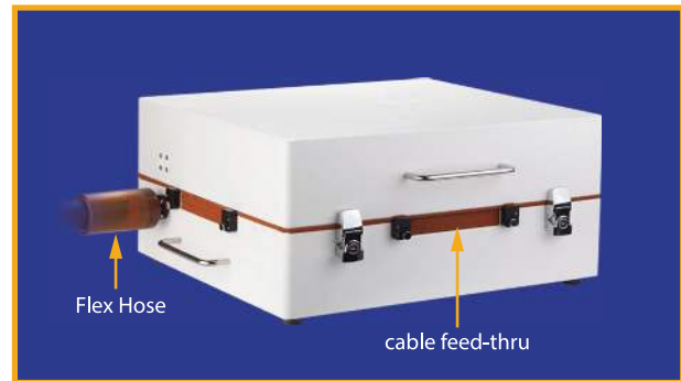
Compact Chamber Clamshell Model

Compact Chamber Clamshell Model 14Wx16Dx6.2H inches