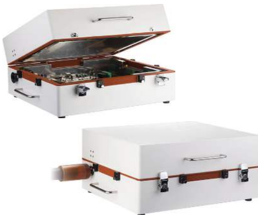
Clamshell Compact Chamber Open/Close Easily

ThermalAir TA-5000 Compact Chamber Clamshell can be opened and closed for quick and easy loading / unloading your parts that need temperature test and conditioning. Temperature test your electronic and non-electronic parts and other devices at temperatures from -60°C to +150°C with a temperature accuracy and uniformity unmatched by large environmental chambers.